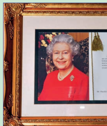
The message from the Queen to 1 Galloway has been framed upstairs.

The club is very competitive in all senses, both in its sport and with its prices. The Committee deal with three main breweries at the moment,