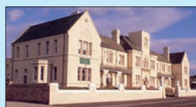
CIU SALT BURN HOUSE