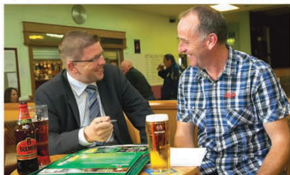
SUPPORT: HEINEKEN in the UK works with its club customers to give them that 'added extra'