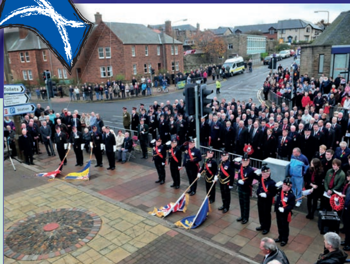
The club organises the town's Remembrance Day parade. Below: the club's pipe band passes one of the town's murals.