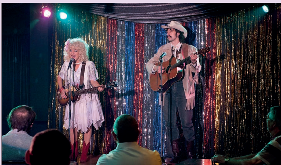
Sheridan Smith and Ralf Little play Sheridan's parents on stage at the Bentley Top Club

In the film Sheridan plays her own mother while Ralf Little, who has played her boyfriend in both The Royle Family and Two Pints of Lager plays her father.