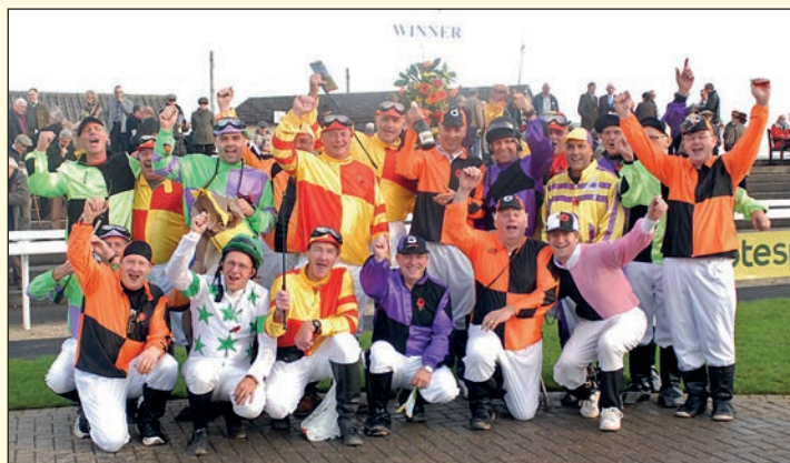
The Driffild Veterans football team, who staged a race across the final 150 yards of the course.