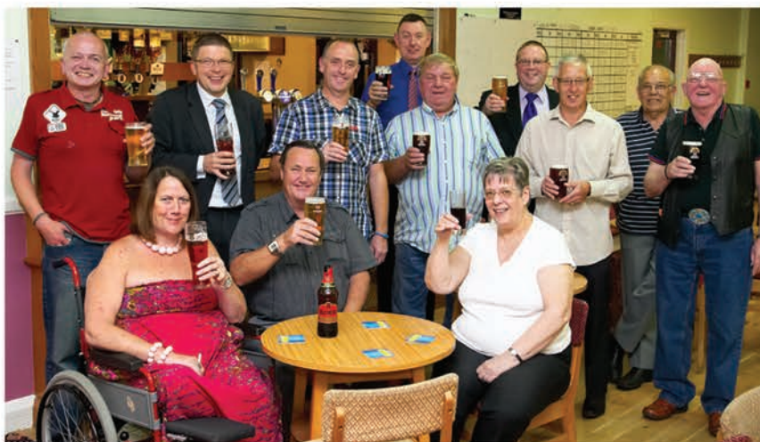
TEAMWORK: Committee and members alike are working to secure the future of their club